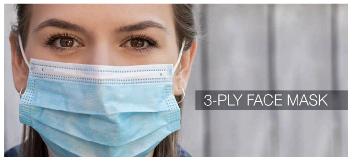
3-PLY FACE MASK

The Disposable 3-Ply Face Mask is composed of 3 ply fabric. Above 95% BFE (Bacterial Filtration Efficiency). $1.50 each for 300 units / $1.39 each for 1000 units